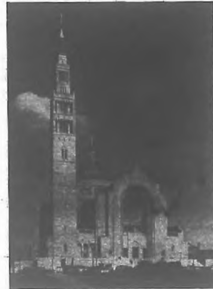
Pohľad na Národnú Svätyniu Nepoškvrneného Počatia Panny Márie vo Washington, D. C.