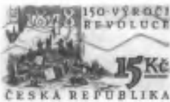
1848 Revolution 150th Anniversary 15 Crowns=.45