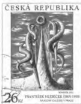
Work of Frantisek Hudecek in National Gallery 26 Crowns=.78