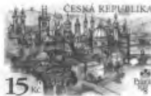
Prague City of Towers 15 Crowns=.45