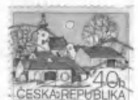
South Bohemia Village 40 Hallers = .01