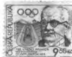
100th Anniversary of Modern Olympic Games J. Guth Jarovsky 9.60 crowns = .26