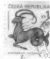
Astrology Sign 1 crown = .03