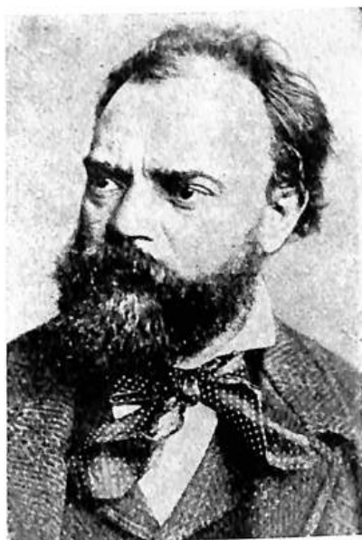
ANTONÍN DVOŘÁK Great Czech Composer (1841-1904)

Entered as Second Class matter Jan. 23, 1953 at Post Office of Chicago, Ill., under the Act of Mar. 3, 1879