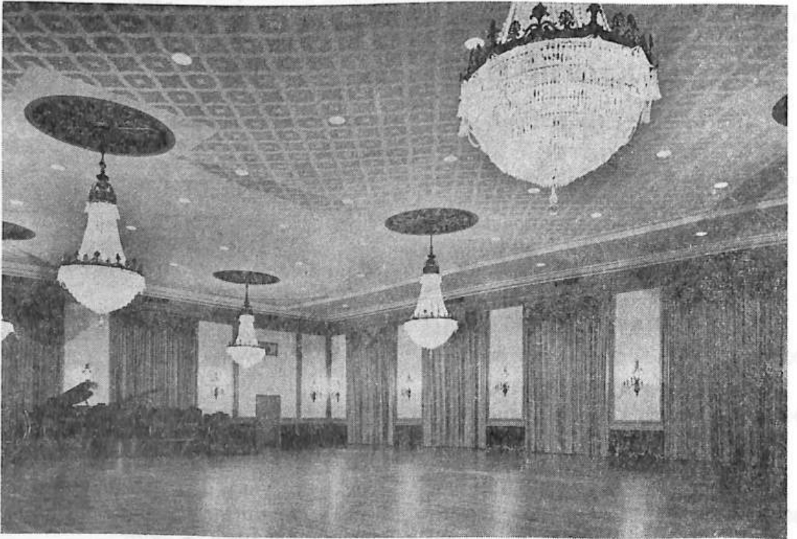
Crystal Ballroom — Baker Hotel — Victory Dance