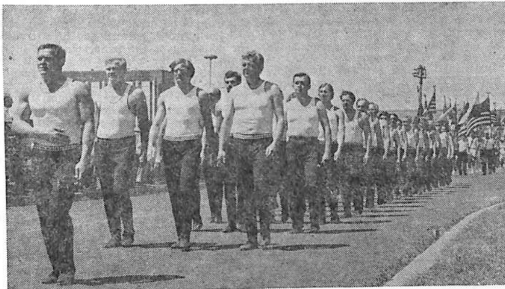
PARADE OF SOKOLS — OPENING CEREMONIES — XIII. A.S.O. SLET