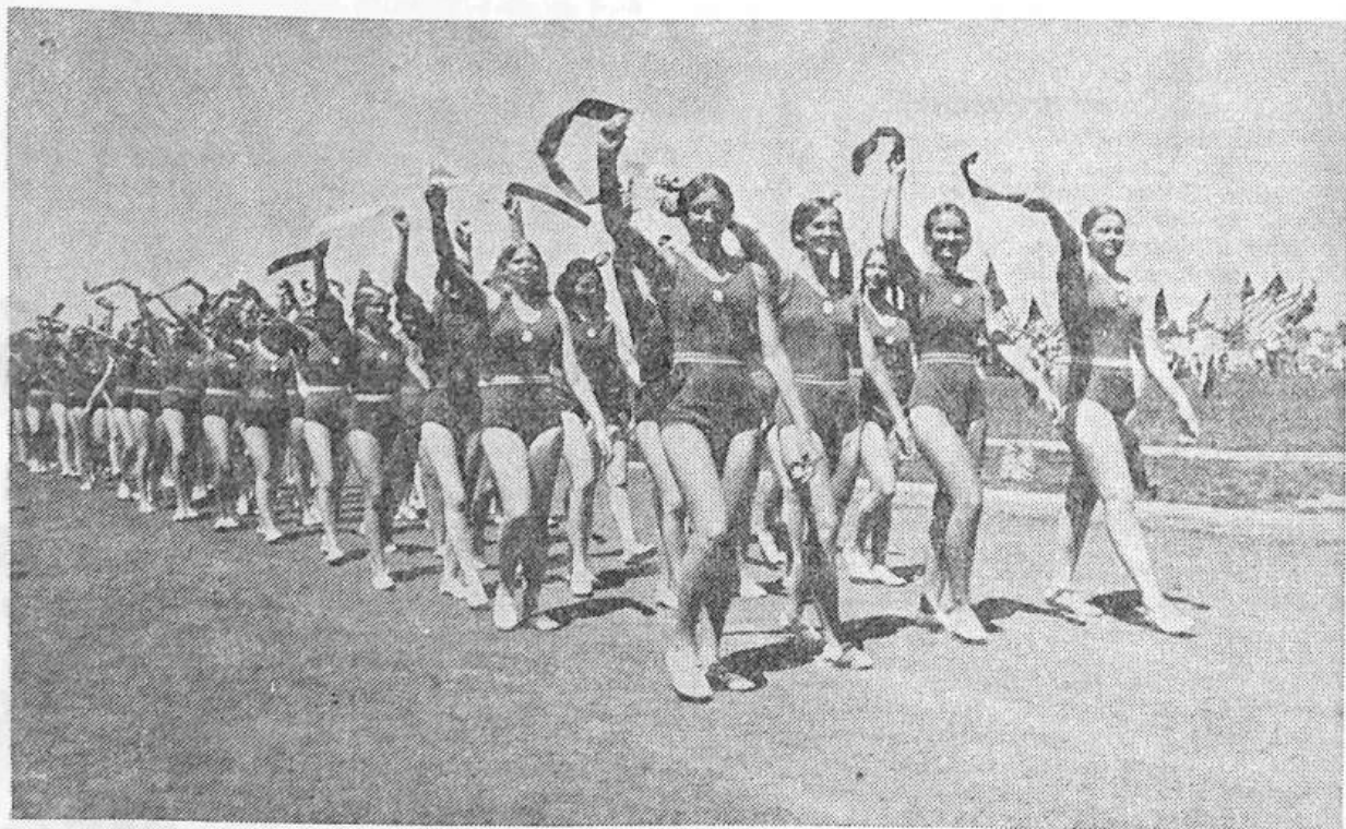
Parade of Junior Girls — Opening Ceremonies — XIII. A.S.O. Slet

Basic Grants will be given directly to students by the U.S. Office of Education. The same set of standards will be applied to students from all