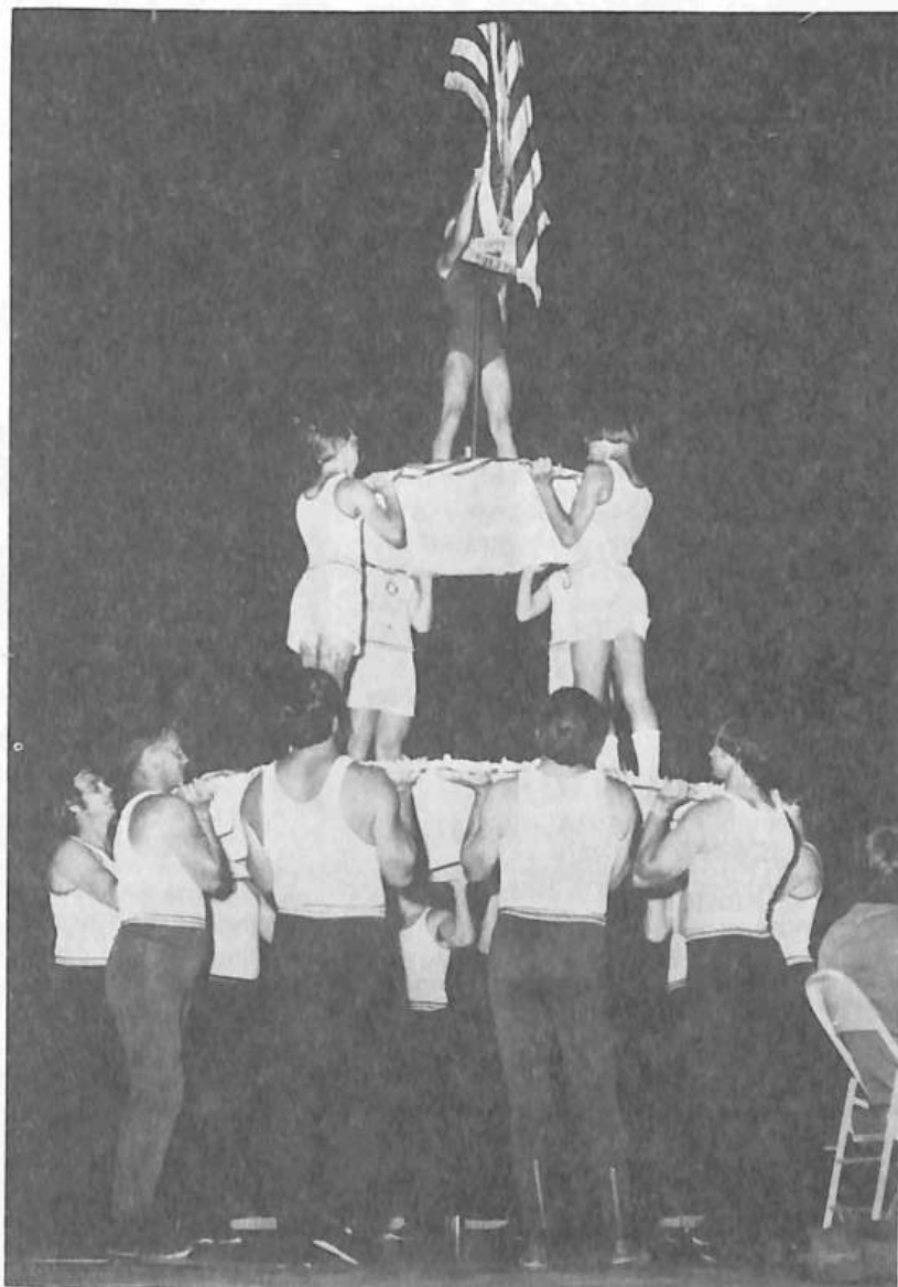
Southern District - Sokol segment of program during SPJST Convention.