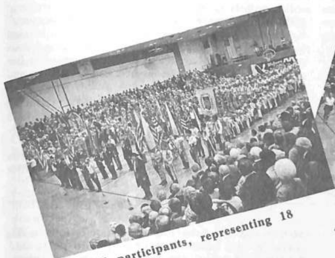
Assembly of all participants, representing 18 organizations.