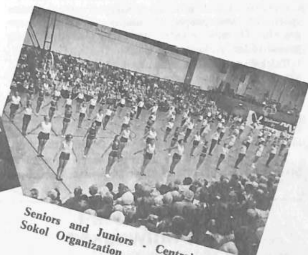
Seniors and Juniors - Central District American Sokol Organization - performing calisthenics.