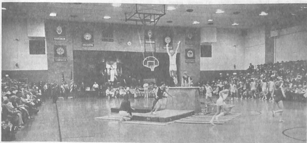
Central District ASO - Tumbling Group.