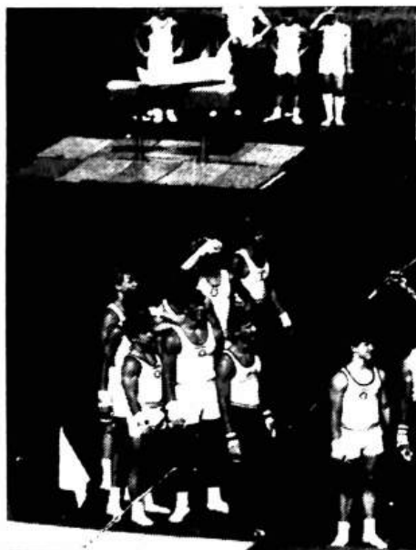
Bro. Jim Hartung, Olympian, performing at XVI Slet.