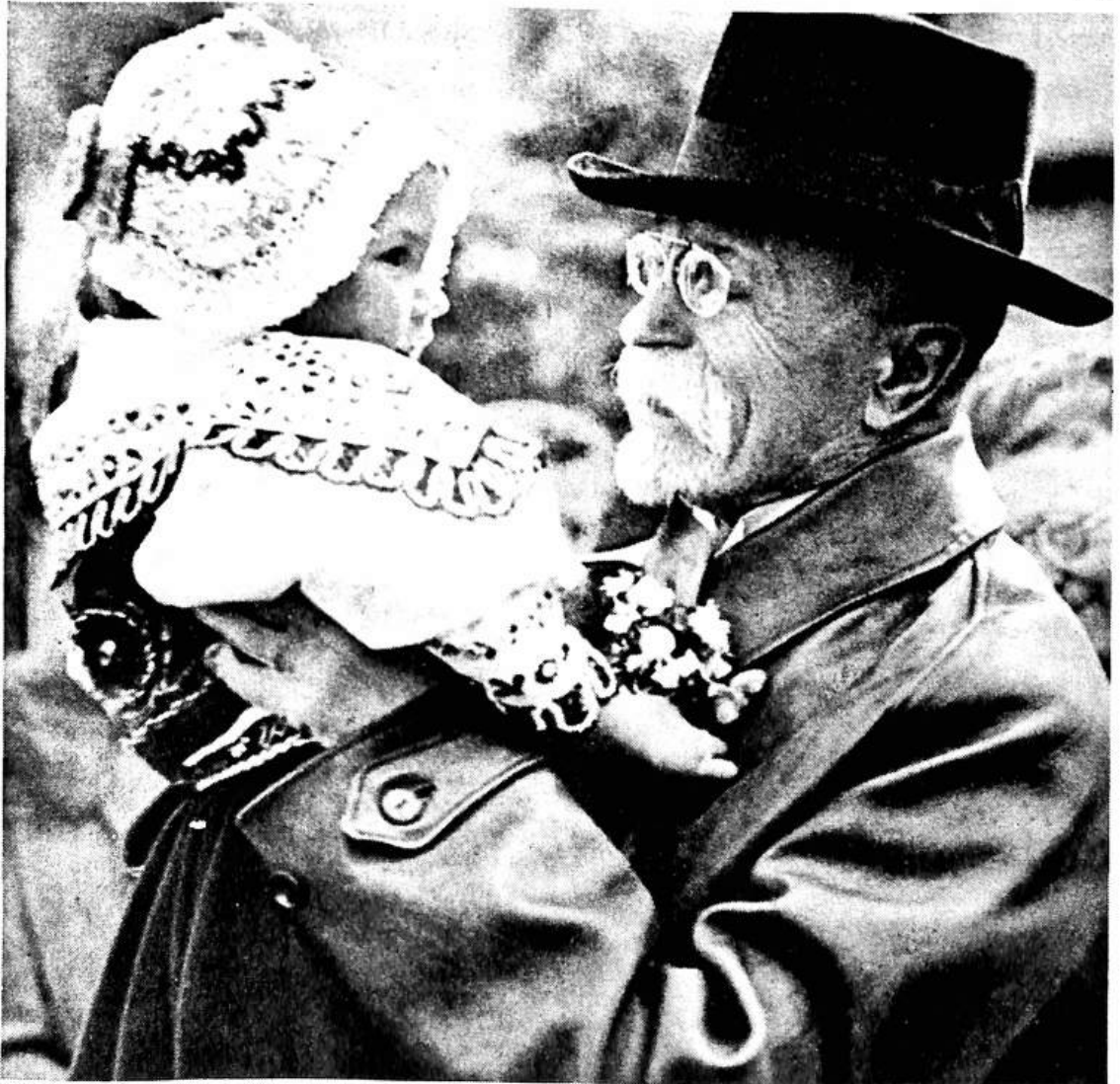
Tomáš Garrigue Masaryk