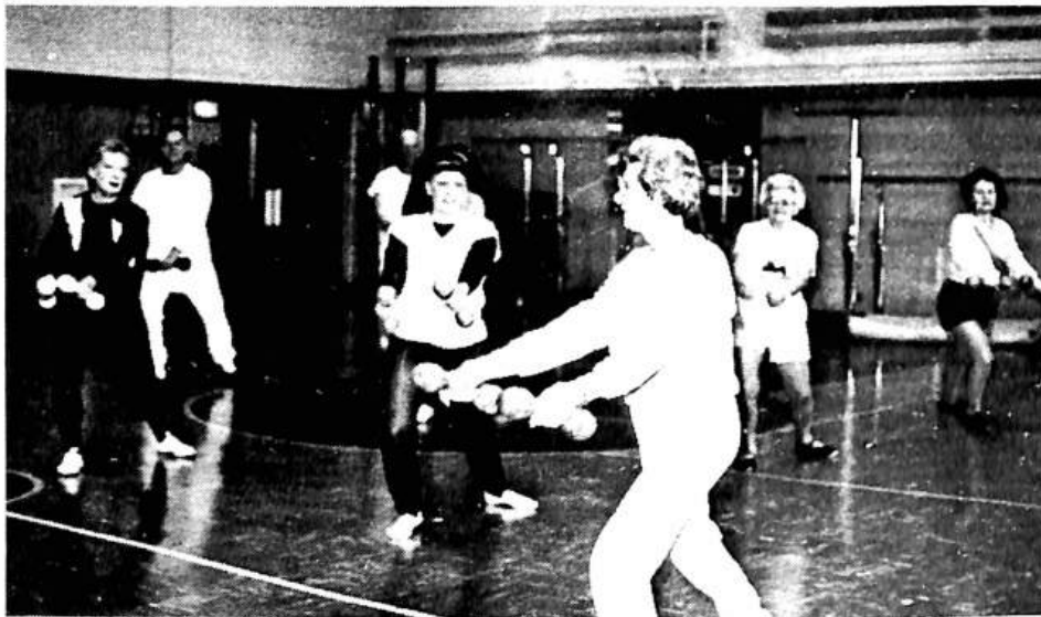
Cha Cha Cha.