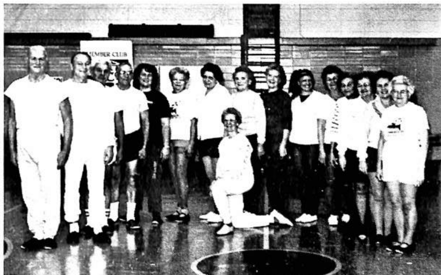
We're proud & we show it!