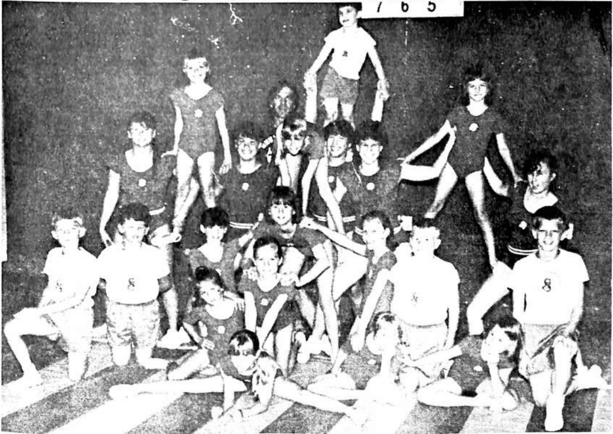
SOKOL CORPUS CHRISTI'S gym classes had a successful year and competition, as this picture well reveals. These gymnasts love to climb so pyramids should be a natural in their special numbers!

A quote from SOKOL MIAMI'S newsletter reminds us all of our obligations as Sokol members and as caring persons, "We, of Miami Sokol, have 19 years of experience in the Sokol brotherhood among our people in Florida — and we feel we have done a great service in the community of Czechs and Slovaks in Southern Florida. Since the year 1969, without interruption, we have met weekly for educational, gymnastic and social activities. We have brought our members to recognize that in their retirement from their unit of younger days they have an open field to continue their lives in the goals of Tyrš and Fuegner. Dedicated leaders in charge of the children in the many units across the United States showed us that serving is caring, and we made good students and better citizens for this great country."