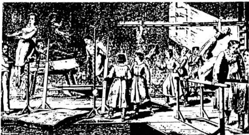
Women's gymnastics circa 1861