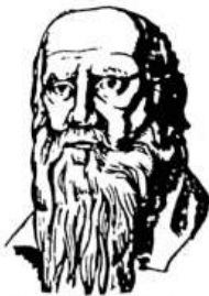
Friedrich Ludwig Jahn

1824 —Jahn was tried after an imprisonment of five years. He was found "not guilty" and released. Despite this verdict, the King issued a special order that Jahn could not live within 10 miles of Berlin nor in any University city. He was to be placed under police surveillance in a city of his own choice. He elected Friedberg. He was awarded a stipend of $1,000 per year as a Professor of History but was not permitted to teach either History or Turnerism.