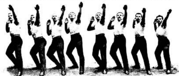
Vítězná závodní družstva České Obce Sokolské, Londýn 15. června 1910. Závodní cvičení partióků. The victorious competitive range of the Česká Obce Sokolská, Londýn 15. června 1910. Common competitive exercises. Les vainqueurs des concours de Česká Obce Sokolská, Londres 15 Juin 1910. Exercices libres de concours.

Spectators — admiring the beauty and skill of their brothers — with the music playing, the rustle of trees, and distant murmur of rushing water and the quieting noise of the city — fringed by the dark surface of the river Vltava — all that added to an unforgettable evening.