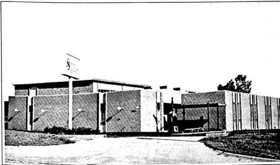
Sokol Cultural Center, Home of Sokol Detroit, Dearborn Hts., Michigan

Sokol has been a way of life for families of Czechoslovak heritage in the Detroit area for over one hundred years. In 1875, twelve enthusiastic new Americans founded the first physical cultural Unit Sokol Detroit. By 1878, the first Sokol Hall in Detroit was built. In September, 1881, Sokol Detroit merged with the fraternal organization "Budivoj" and became Sokol Budivoj. A second Sokol unit, Sokol Podipny, was founded in 1889. It was at Sokol Podipny that the women first organized a circle of ladies and girls to "care for the spiritual and physical well being of our youth..." By 1909, a new wave of immigrants founded a third Sokol Unit, Sokol Palacky. By 1914, Sokol Podipny had outgrown its original home and built a new Czech National Hall which became the center of all cultural and gymnastic activities for Czech-Americans in the Detroit area for fifty years. These three Sokol Units, Sokol Budivoj, Sokol Podipny and Sokol Palacky, merged in 1917 into one large Unit, known to this day as Sokol Detroit.