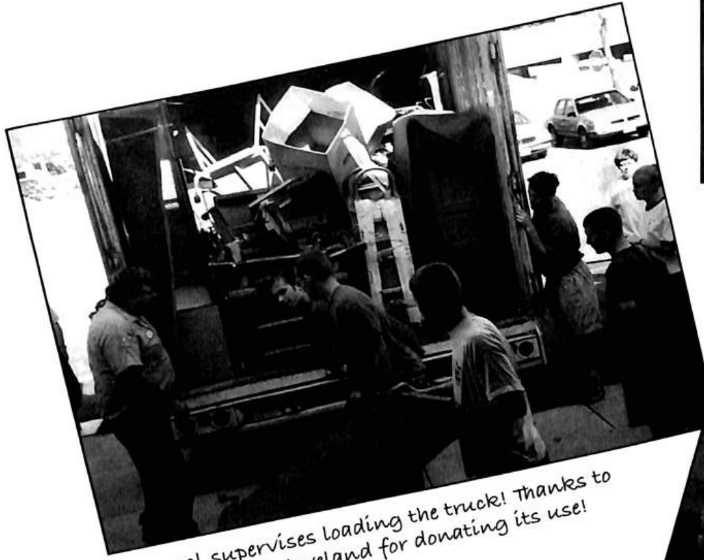
J.J. Vencel supervises loading the truck! Thanks to Sokol Greater Cleveland for donating its use!