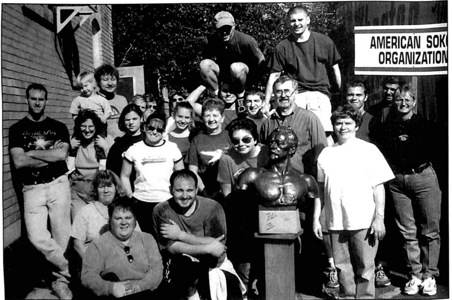
Some of our GREAT movers!