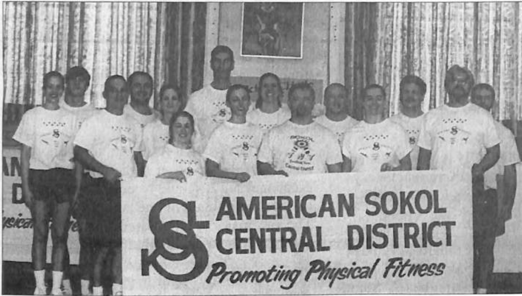
Left: Some of the skills clinic instructors get together for a photo at the skills clinic graduation ceremony on Sunday after gymnasts performed some of the skills they perfected during their long and tiring weekend.