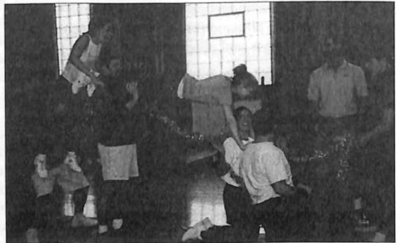
The clinic instructors are hard at work rehearsing their special number for the weekend.