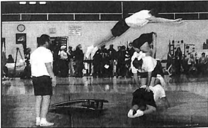
The Central District TNT team wows the audience!