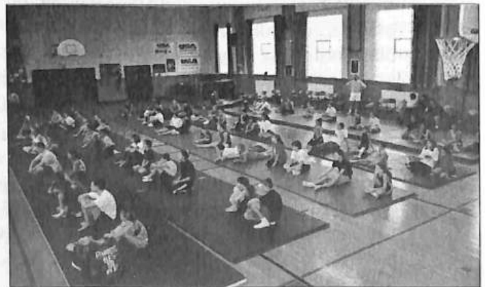
Clinic students are all ears as they watch the TNT team demonstration and wait for directions.