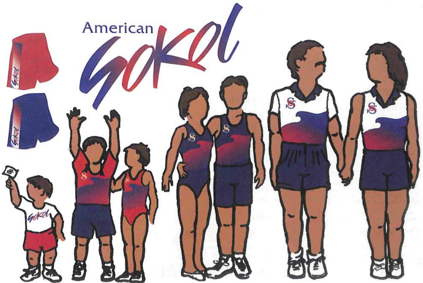
Illustration is representative only. Actual uniforms are slightly different. Color is not accurate above.