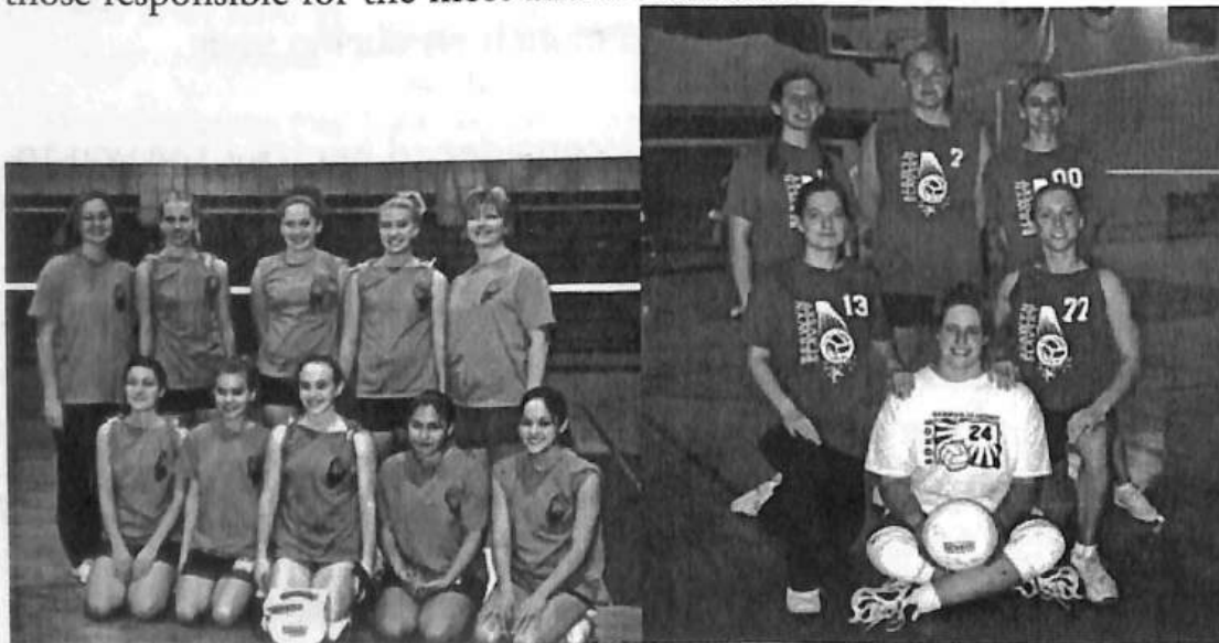
Pictured above: On the left, 1 st place team Junior division; Tabor Inferno and on the right, 1 st place team Women's division; Berwyn-Slavsky Youngsters.

The two first place teams each took home a brand new Tachikara Volleyball, and second place teams each received a $25 gift certificate from SportMart. The two teams will receive a framed picture at a later date. A special na'zdar from all who played to those responsible for the meet and the officials.