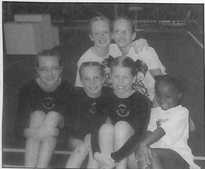
Sokol Ennis Girls