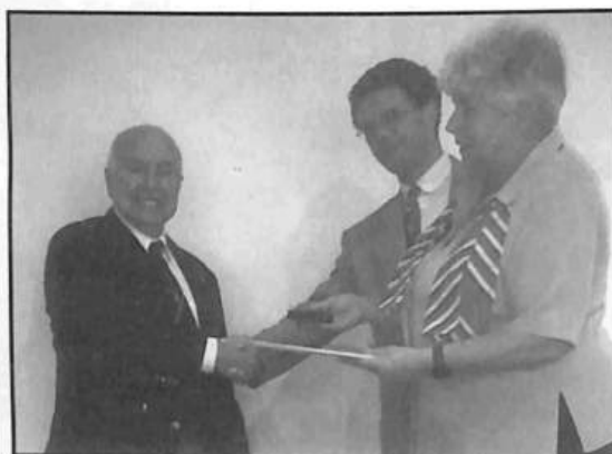
medal. The presentation was made in recognition of self sacrifice and work for the betterment of the Sokol movement.