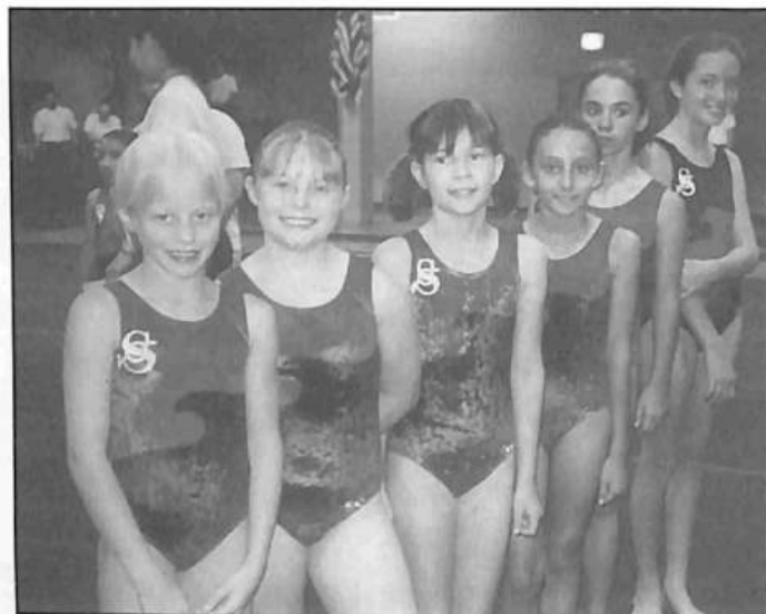
Sokol Ft. Worth Girls