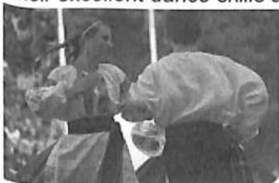
Straznice International Folklore Festival