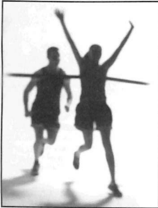
Central District Sokol Naperville Southern District Sokol Spirit