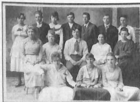
1918 College Freshmen

The Sokol philosophy has instilled in me the love of being physically fit and strong enough to be able to have the ability to work hard for my goals. My ideals and goals are within reach because Sokol has given me the gift of knowing that I can achieve results, no matter how daunting, if I master one step at a time. I know that with the solid foundation that I have learned through my life, I will succeed in my chosen career. I look forward to the opportunity and hope that, by giving me a scholarship, Sokol will also be proud of my achievements.