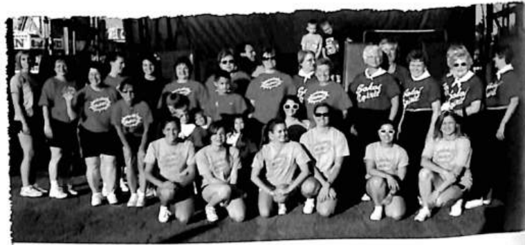
Central District Group