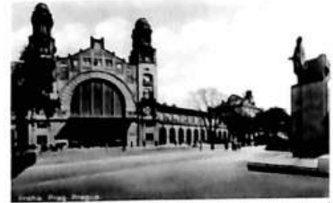
Wilson Train Station and Wilson Monument, 1928-41