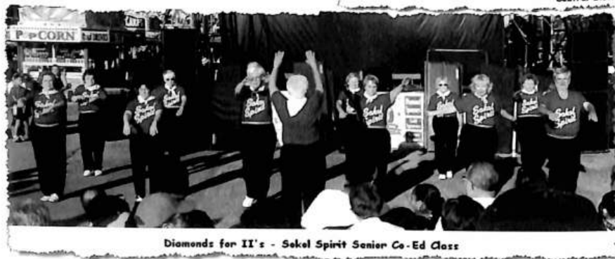
Diamonds for II's - Sokol Spirit Senior Co-Ed Class