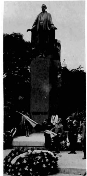
Wilson Monument, Prague 1928-41

For more info please visit: www.afocr.org