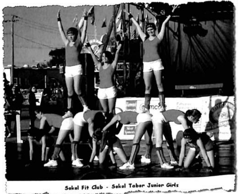
Sokol Fit Club - Sokol Tabor Junior Girls

There was a large, enthusiastic crowd which provided a thunderous round of applause at the conclusion of each performance. We were honored to be a part of this milestone event.