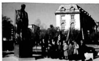
Masaryk Memorial, Washington, DC

Your support is greatly appreciated, and your gift is tax deductible. The IRS has ruled that AFoCR is tax exempt under Sec. 501(c)(3). EIN: 52-1921393