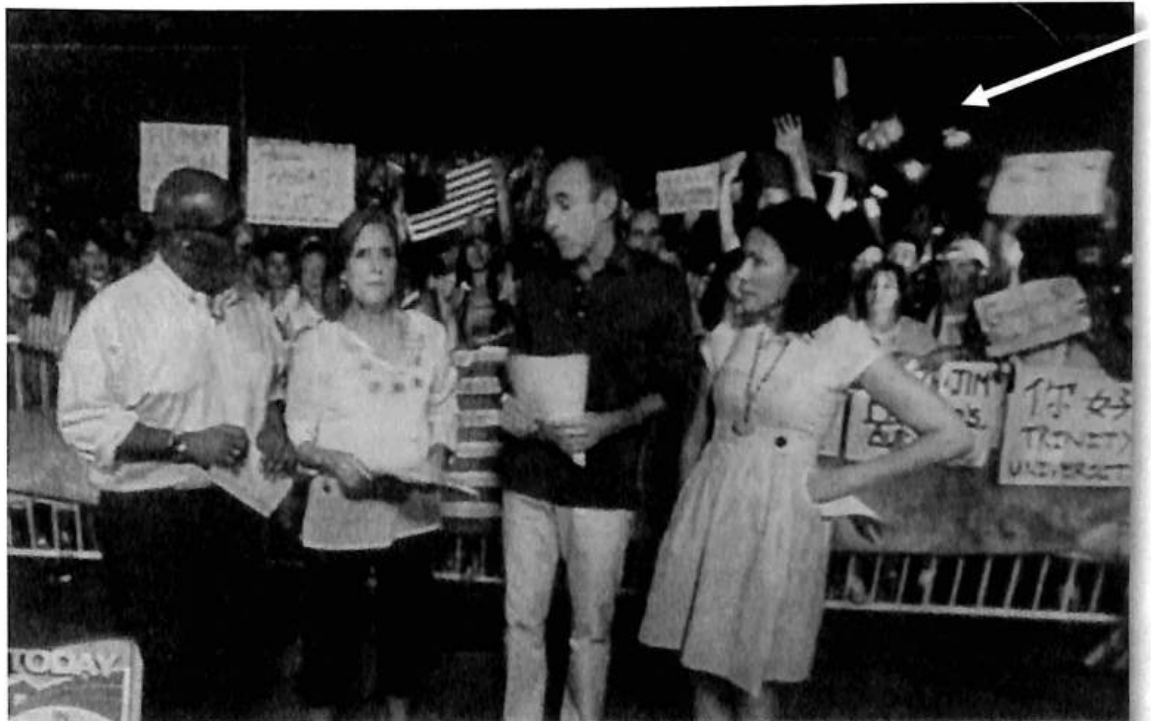
2008 Olympics Beijing