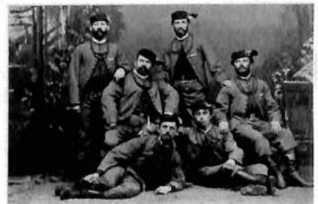
Members of the Sokol club in costume, 1880s