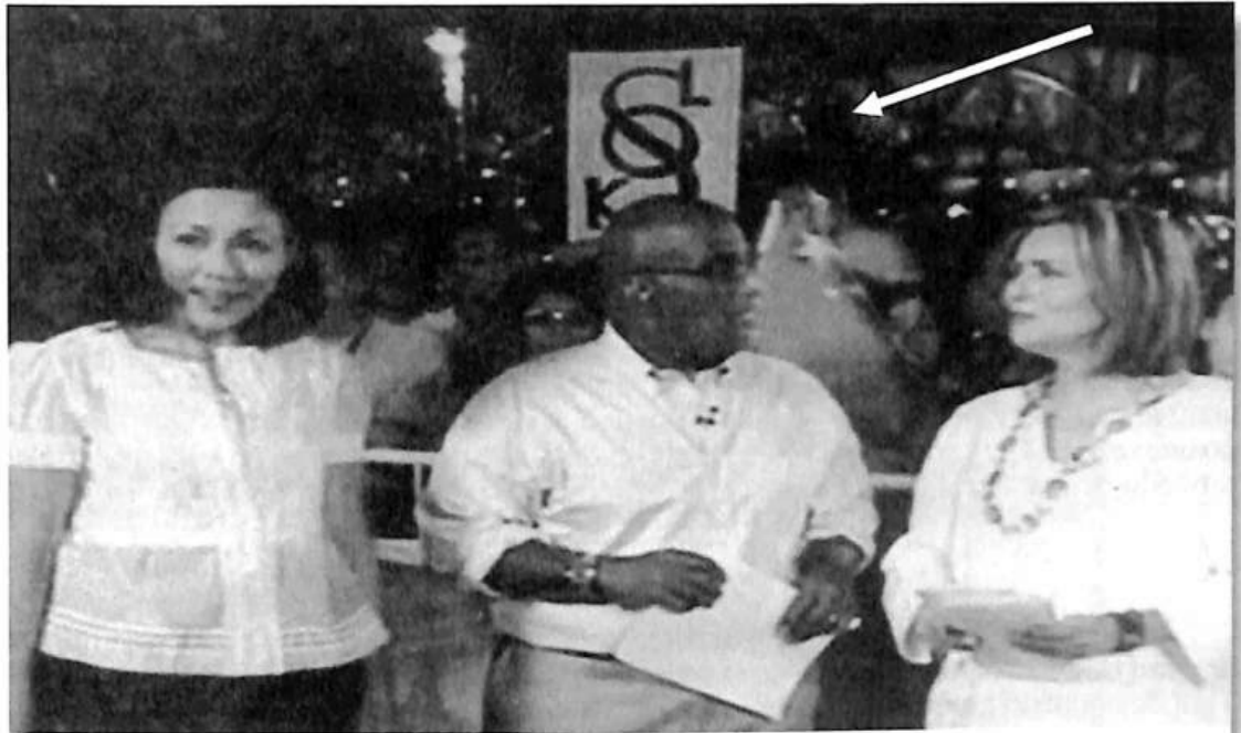
Beijing Olympics - 2008