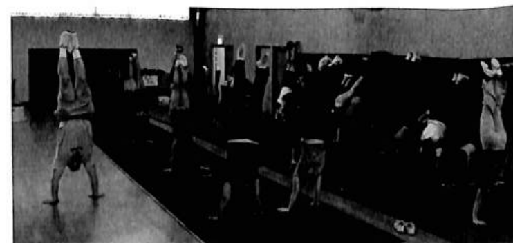
26 participants from Sokol USA Lodge 306