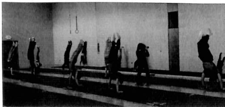
12 participants from Sokol Detroit