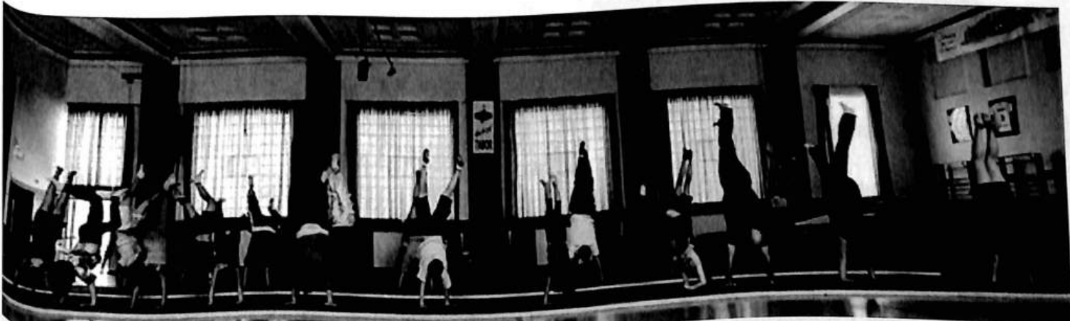
19 participants from Sokol Tabor