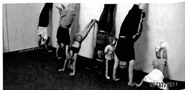
8 Participants from Sokol Chicagoland (some not pictured)