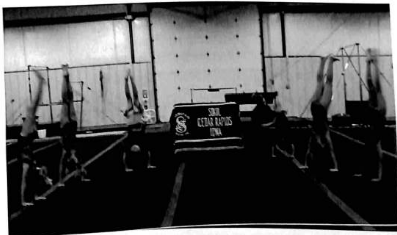
6 participants from Sokol Cedar Rapids

At precisely 1 p.m. ET, 20,478 of participants throughout the country kicked up into a handstand to break the existing record of 2,402, set by Australian gymnasts in Melbourne to promote the 2005 World Gymnastics Championships. Learn more about Sokol's participation and see more photos on page 14.