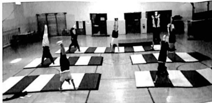
7 participants from Sokol Spirit