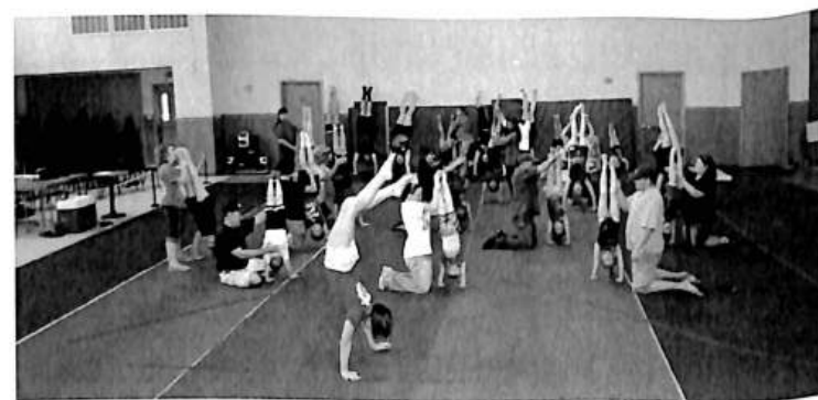
22 participants from Sokol KHB