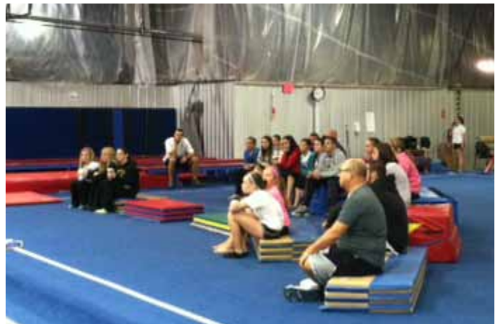
Opening lecture on safety