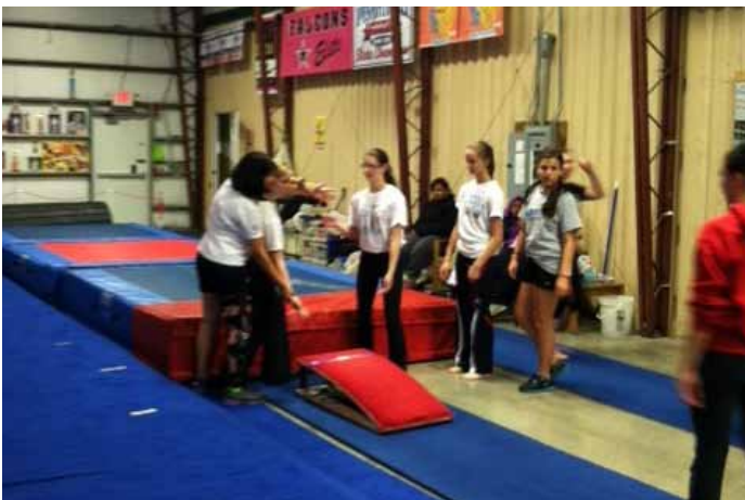
Charity instructing at vault