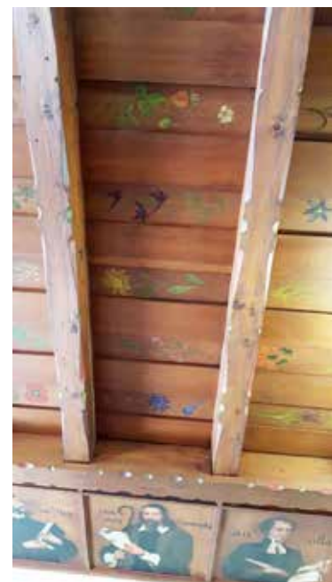
University of Pittsburgh, Center for Learning, Czechoslovakian Nationality Room