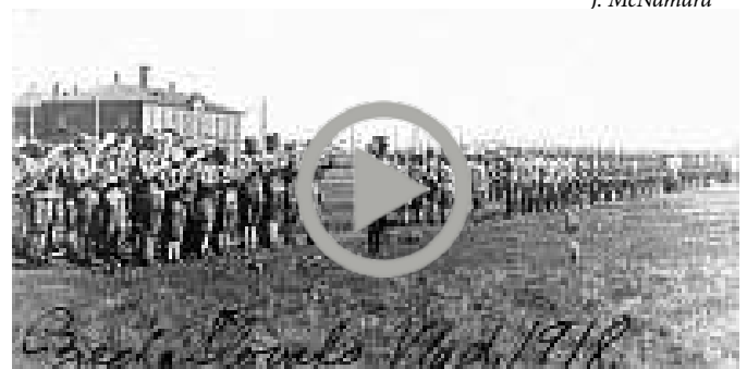
Czechoslovak legionnaires in Russia

http://www.radio.cz/en/section/czech-history/us-author-highlights-legionnaires-role-in-founding-czechoslovakia