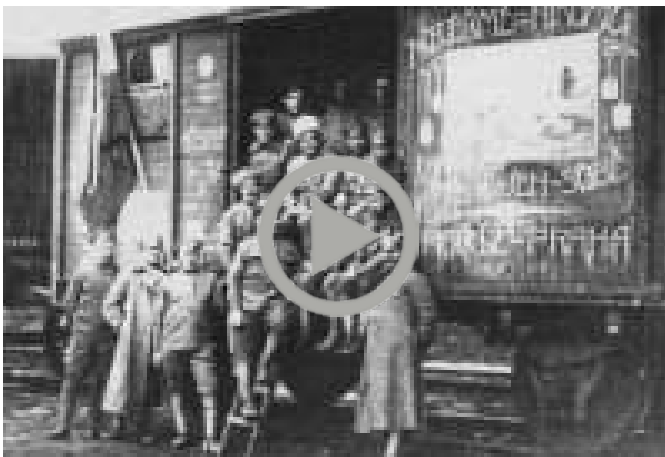
Czechoslovak legionnaires in Russia