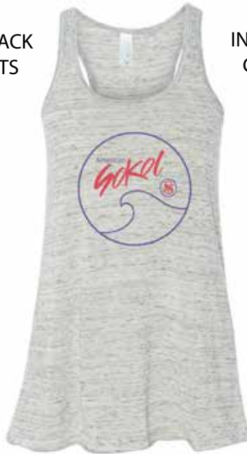
IN 3 GREAT COLORS