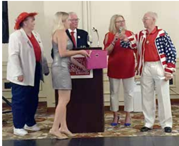
Red, White & Blue Winners