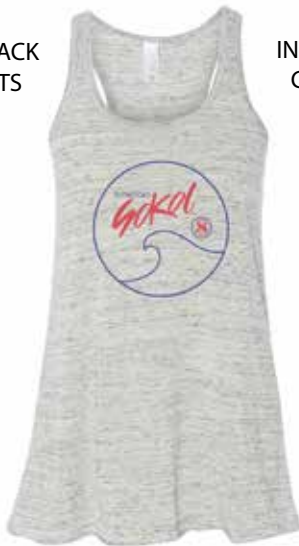
IN 3 GREAT COLORS