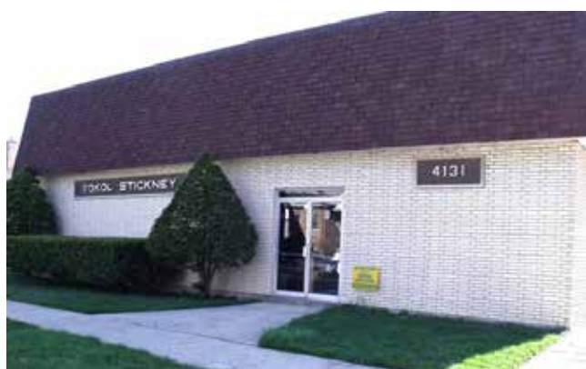
4131 Home Ave.