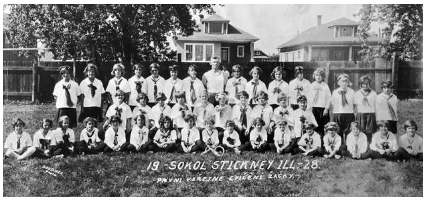
Stickney children 1928