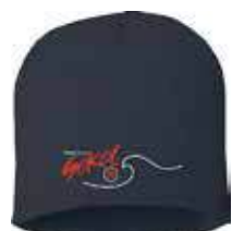
KNIT BEANIE QTY: _____