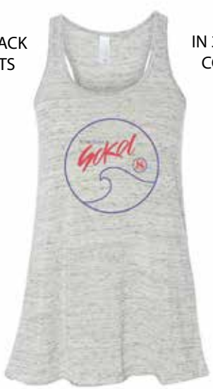
IN 3 GREAT COLORS