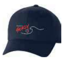
NAVY BASEBALL QTY: _____