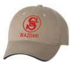
KHAKI BASEBALL QTY: _____