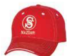
RED BASEBALL QTY: _____