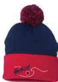
KNIT POM QTY: _____