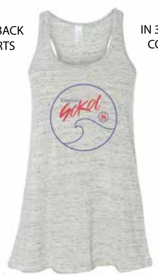
IN 3 GREAT COLORS