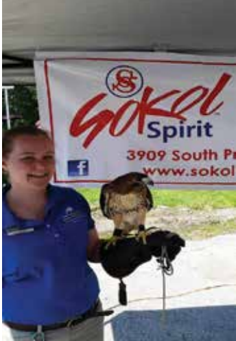
That should draw attention!