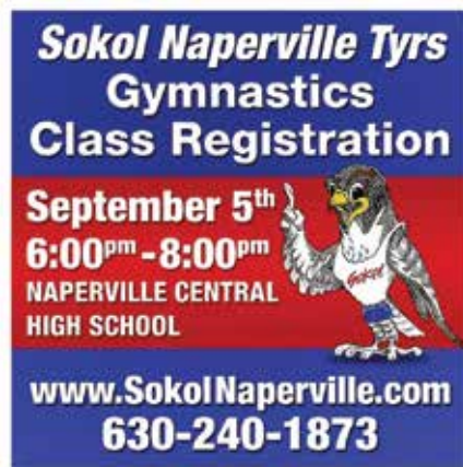
Naperville's parkway sign

Just think, if $200 spent in advertising returns two new youth members, you're already ahead. Plus... we'll give you back the two bills!